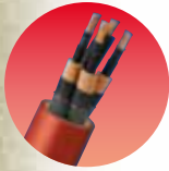
Medium-voltage flexible cables