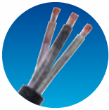
Low-voltage loop rubber cables