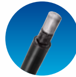
Low-voltage fixed installation cables