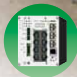
Active switch systems

These durable, environmentally-safe cables are supplied to all major MV generator manufacturers worldwide involved in wind turbine technologies.