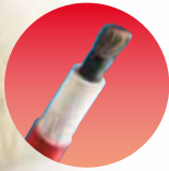
Low-voltage 120° flexible cables