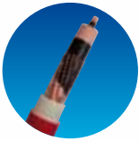
Medium-voltage fixed installation cables