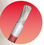
Medium-voltage 180° singlecore cables