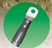
Low-voltage sets and kits